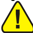
Lab Manager Utility